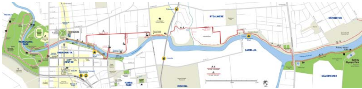
Parramatta to Sydney Olympic Park Cycling Map (PCC 2010)

The opportunity to undertake this interpretation initiative has arisen from a broader revitalisation project titled the Parramatta Valley Cycleway.