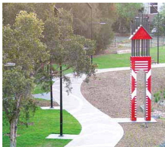
Interpretation of the old Sentry Box (2009)

There are also 4 sound scapes that were designed for each location. Council is currently considering how other interpretative media (live or otherwise) can be developed to leverage the installations and offer a multilayered sensory experience.